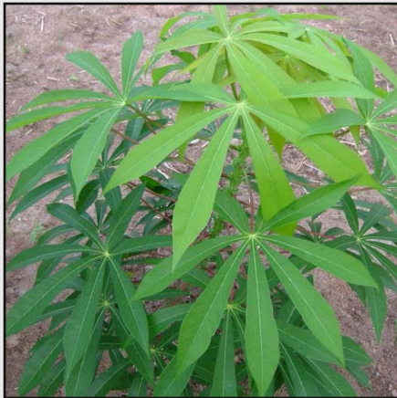
Cassava Manihot esculenta

Cassava is a tall semiwoody perennial shrub or tree. Plants can grow more than 20 ft. The cassava has several edible parts that can be eaten after proper preparation. Cassava thrives on poor soils and needs almost no attention to produce bountiful crops of edible roots.