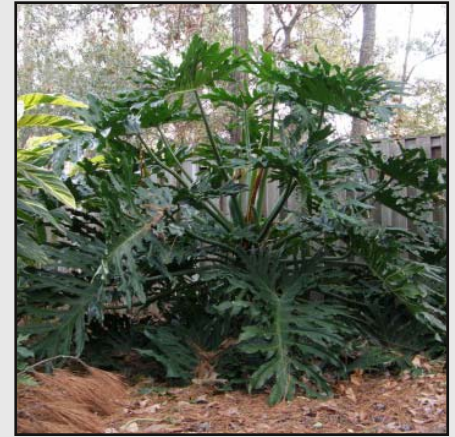
Tree Philodendron Philodendron bipinnatifidum

It grows as a woody shrub. It has huge leaves and one stem that does not branch. It can get to 10' tall and 15' wide. It grows best in moist, but well drained soil. It does not want full sun, dappled to part shade is best. This plant is not drought tolerant, so water when times are dry.