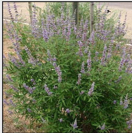
Chaste Tree Vitex agnus-castus

Cassava is a tall semiwoody perennial shrub or tree. Plants can grow more than 20 ft. The cassava has several edible parts that can be eaten after proper preparation. Cassava thrives on poor soils and needs almost no attention to produce bountiful crops of edible roots.